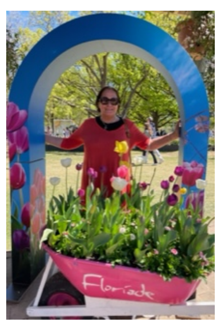
Canberra Sat 16 Sep 2023 - Sun 15 Oct 2023