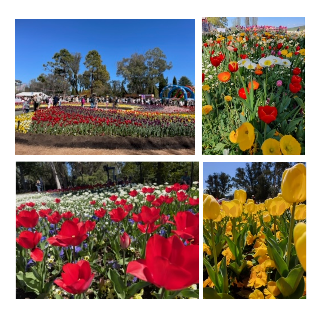
Once again, the festival's program is jam-packed with entertainment, cultural celebrations, food, workshops, and more.