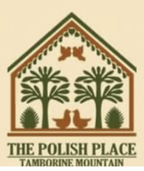
Closing the Door on 40 Years of Memories