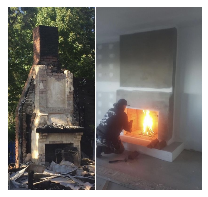
Ania - Fire broke out in the kitchen area about 2.15 am and quickly engulfed the entire main building, a beautiful timber chateau reminiscent of central Europe. We were woken by a smoke alarm and managed to rush outside. We were taken to hospital for smoke inhalation and after coming home we realised that we have lost everything. Our pride and joy, and all memories were gone in a flash. My dream was always to share a slice of my homeland with Australian people and having all gallery items gone with the fire was for me a real personal tragedy. But despite a fire, destroying our home and restaurant, it was with the local community's support that we were able to rebuild and re-open the restaurant.